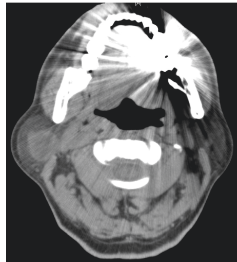
FIGURE 2: CT with contrast revealed an enhancing multilocular cystic lesion in the right parotid gland.

including alcohol, hepatitis B, hepatitis C, and primary biliary cholangitis [11]. Other reported predisposing conditions include immunosuppressant use, malignancies, and diabetes mellitus, although one study suggested that diabetes was not a risk factor [7, 10]. As cryptococcal meningitis can be asymptomatic in as high as 43% of infected cases, a lumbar puncture should be conducted in all infected patients without contraindications [12]. Although a high index of suspicion is required, screening for cryptococcal antigenemia has been shown to be of little use, testing positive in none of 294 cirrhotics in a Korean study [13].