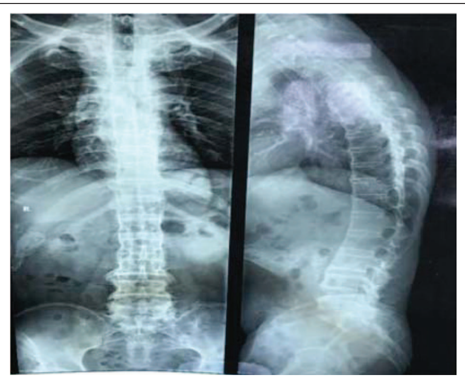
Figure 4. The spinal anterioposterior and lateral radiographs of patient in Case 2. The bamboo-like changes of spine can be found in the radiograph.

side. The patient had hypertension for 6 years and was treated with oral nitrendipine. She also had a history of cerebral infarction 3 years ago. MRI of brain revealed multiple old softening foci in the right basal ganglia region. She had taken aspirin and ginkgo tablets for anticoagulation therapy and prevention of recurrent stroke. The preoperative visual analog scale (VAS) score of this patient was 4. The ultrasound-guided lumbar SNRB plus T12 paravertebral and sacral plexus blocks were performed with 25 mL of 0.4% ropivacaine. Pinprick test was used to confirm the success of these blocks. This technique completely met the analgesic requirement of this patient during surgery. The time of surgery was 1 hour and 12 minutes. With the PCA, the postoperative VAS scores were 0 to 1. This patient discharged on the third day after surgery. No postoperative complication was reported with her.