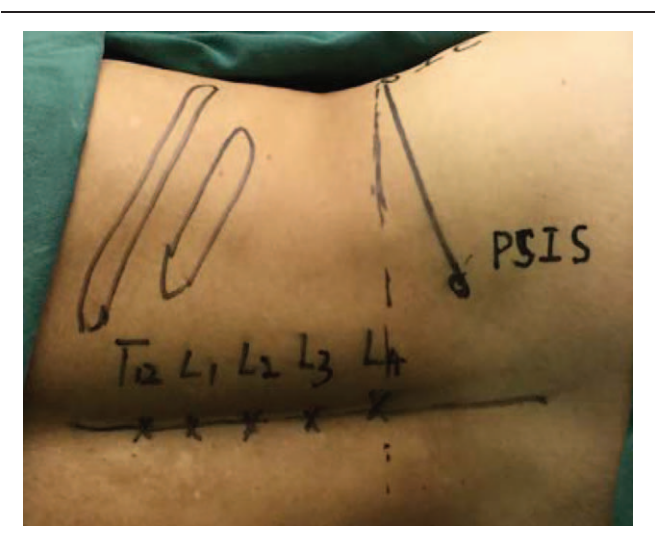
Figure 1. The surface anatomic landmarks for block. IC=iliac crest, PSIS= posterior superior iliac spine.

Sichuan Guorui Medicine Co, Sichuan, China) at 0.6 to 0.8 \,\mu g/kg (over a period of 20 min) and followed by an infusion at 0.2 to 0.5 \,\mu g/kg/h. All patients received the peripheral nerve block 30 minutes after the sedative drugs were infused. The patient was placed in the lateral position with the operated side uppermost.