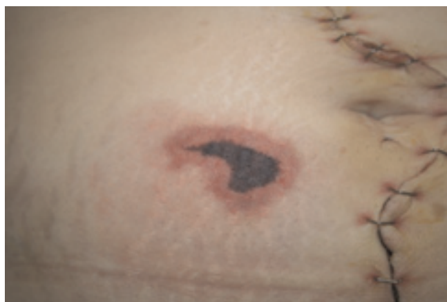
Figure 1. Necrotic eschar at nadroparine injection site.

Essential thrombocytosis is an acquired myeloproliferative disorder, characterized by the overproduction of platelets by megakaryocytes in the bone marrow in the absence of an alternative cause. Arterial and venous thromboses