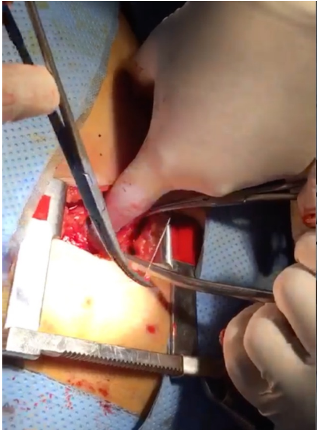
FIGURE 3: Foreign body removal