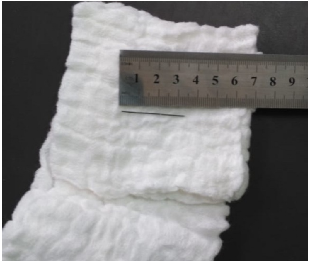
FIGURE 4: The foreign body scale

A sample of the pericardial effusion fluid was sent for gram stain, culture, and sensitivity to tailor the post-operative antibiotics accordingly. The pericardial space was washed out with normal saline, a pericardial drain was inserted, and the wound was closed around the drain. The patient was taken to the cardiothoracic intensive care unit (CTICU) and started on intravenous antibiotics. The following day, CXR and echocardiography were performed ensuring that there was no collection present and that no damage was caused to the tricuspid valve or the interventricular septum intraoperatively. The patient was determined to be stable and transferred to the surgical floor for further recovery and monitoring. After five days, she was discharged home with complete resolution of her symptoms.