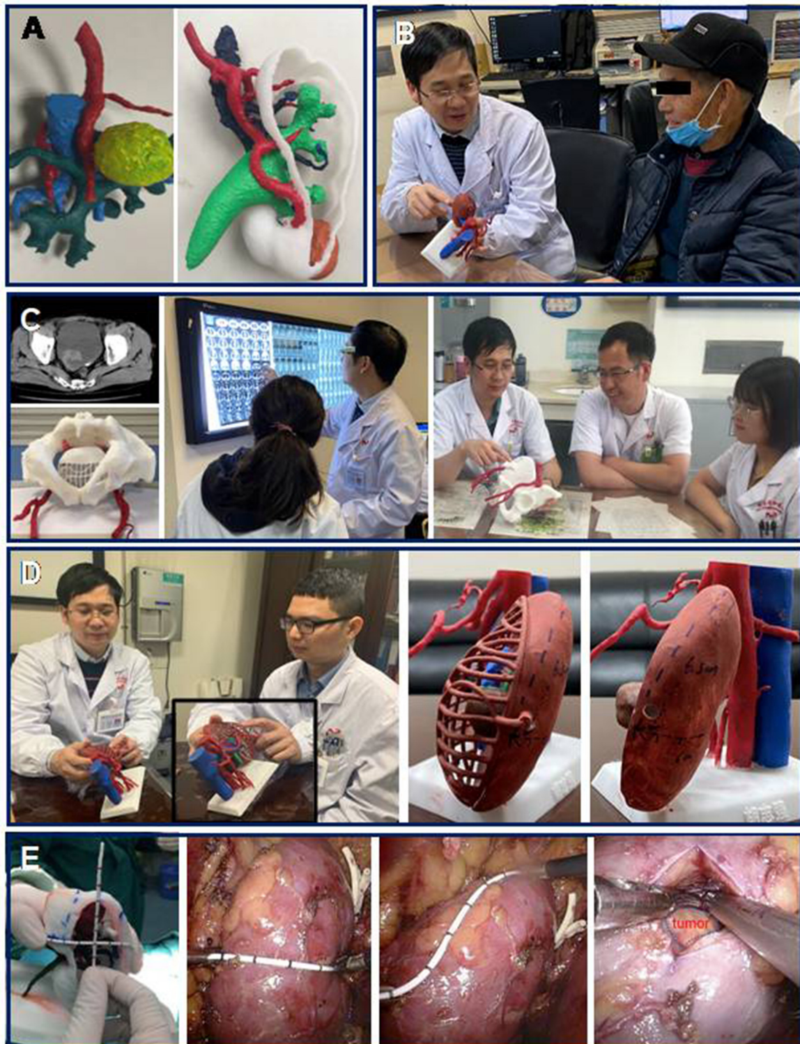
FIGURE 1 | 3D printing in clinical practices. 3D printing as an evolving technology enables the creation of patient-specific physical models with high precision that contribute to patient understanding, simulation training, as well as surgical planning and guidance. (A) 3D physical kidney models. (B) 3D-printed model in patient counseling. (C) 3D-printed model in anatomical and surgical education. Students were provided with 3D models during the training section. (D) 3D-printed model for preoperative planning. Surgeons discussed surgical planning and complexity, as well as potential complications, assisted by a patient-specific 3D model. Tumor markers are labeled on the surface of the models. (E) 3D-printed model for intraoperative guidance. 3D physical model utilized in laparoscopic partial nephrectomy. Based on the markers on the surface of the kidney model, a renal mass can be quickly located with precise orientation.