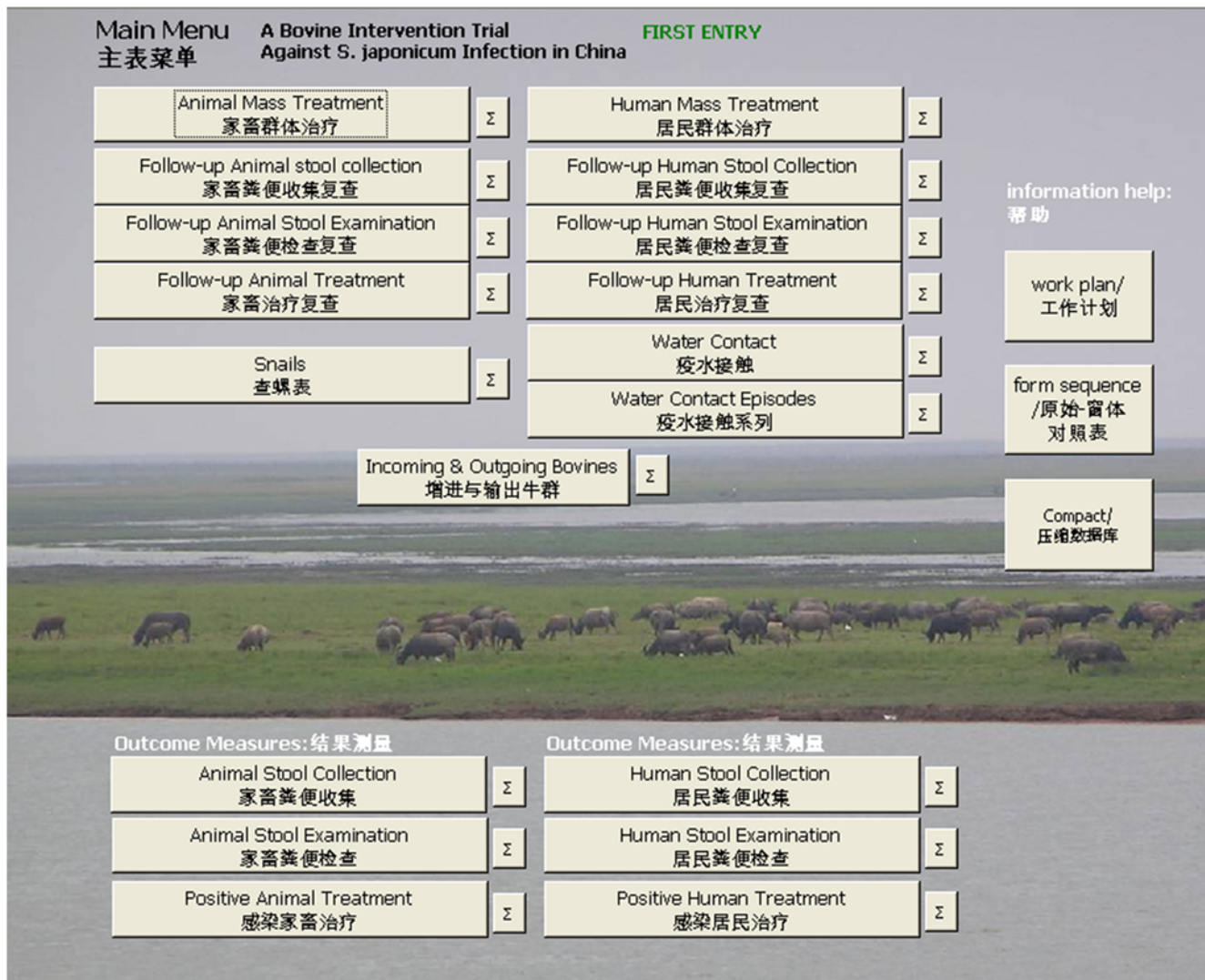
Figure 2. Screenshot of database main menu. doi:10.1371/journal.pntd.0000413.g002

as it evaluates the performance of the data entry staff and the internal double-entry check function. Anomalies in the results or a bias towards either the first or second entry prompt further investigation as to the source of the discrepancy.