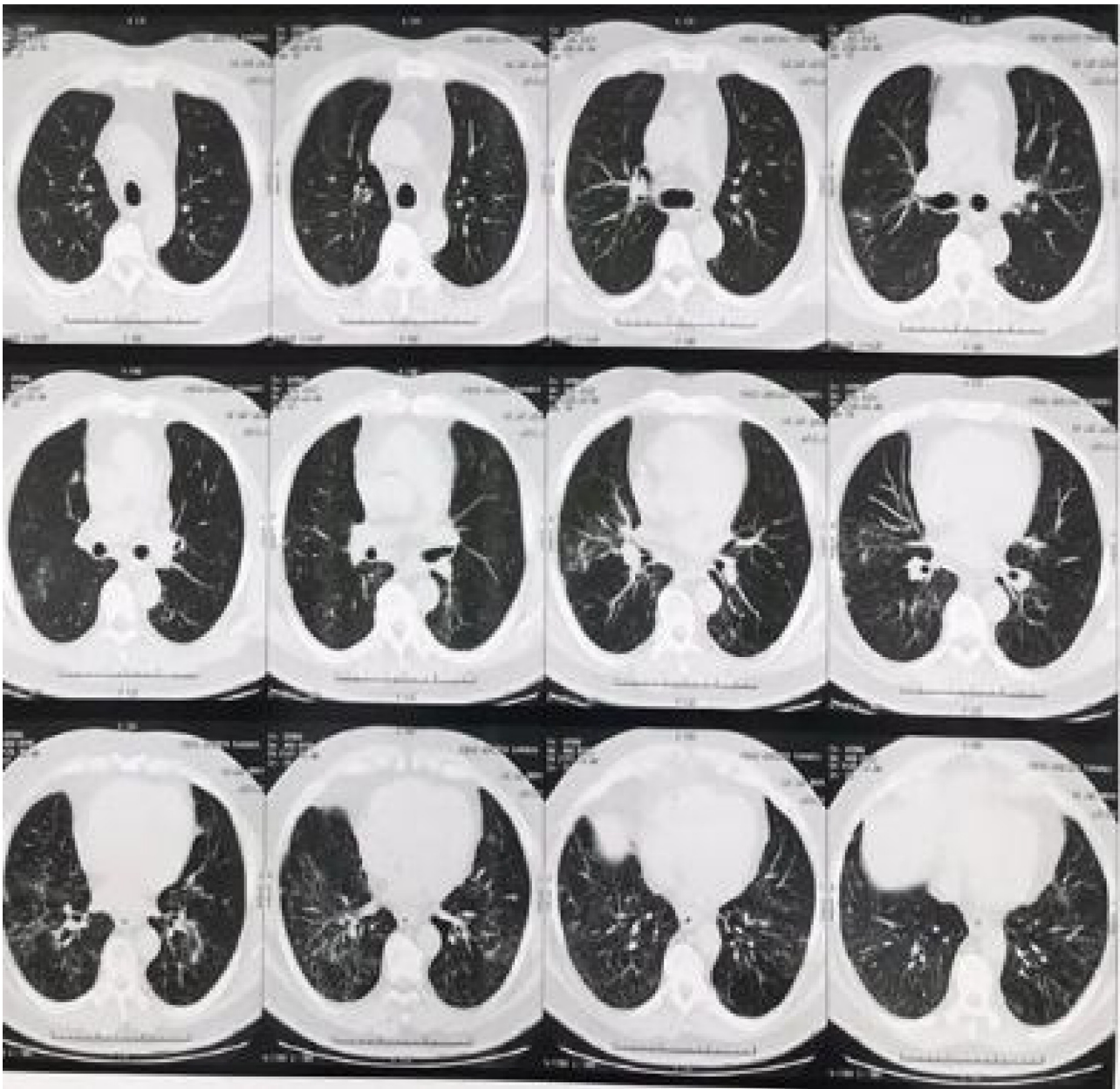
Figure 1 Bilateral pulmonary infiltration characterized by ground-glass opacities and fine reticulation with a basal predominance. Nodular and ground-glass opacities with sparse centrilobular distribution, more evident in the middle lobe.