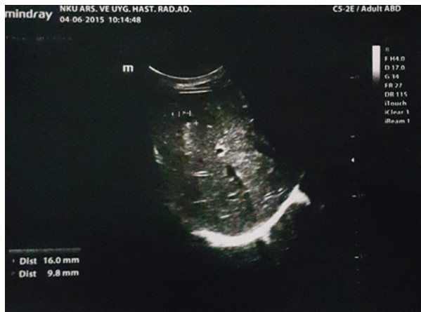
Figure 1. Ultrasonography of the liver showing small echogenic foci.

On the fifty-ninth day of the treatment, the levels of serum alanine transferase level and serum aspartate transferase decreased to the reference range. The repeated ultrasonography at the end of the treatment showed normal result.