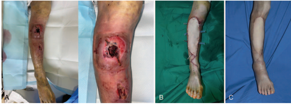
Figure 4. A, The wound with bone exposure was on the right pretibial area. B, The wound was covered with anterolateral thigh free flap. C, At postoperative 6 months. The result was satisfactory without any early and late complications.

and recurrence in such cases. Some wounds can turn into chronic wounds, which prolong treatment and increase costs, and skin cancers may even occur. [16]