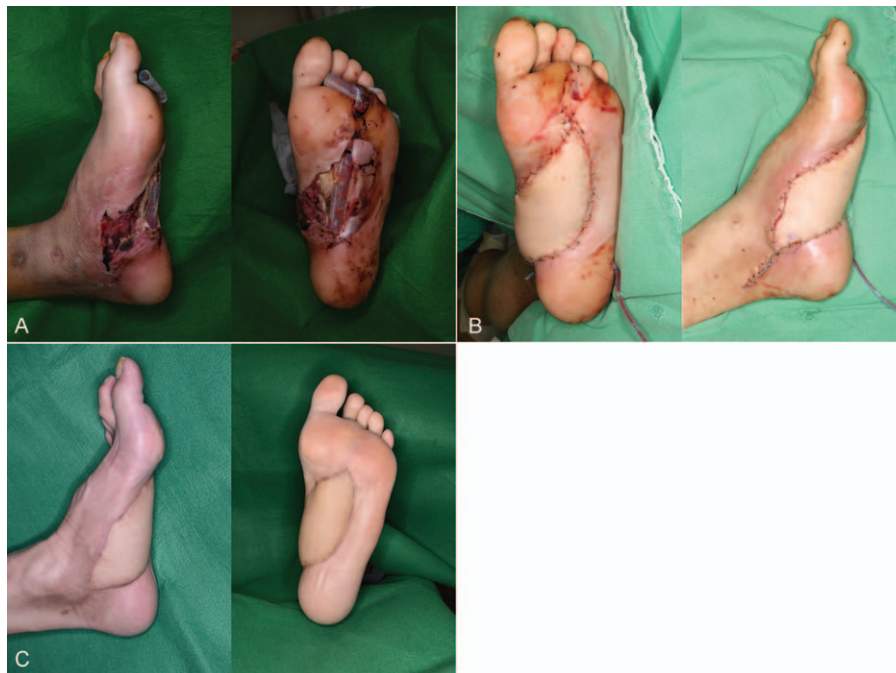
Figure 3. A, A complicated wound with the exposure of tendon, muscle, and bone on the left foot. B, The wound was covered with anterolateral thigh free flap. C, At postoperative 1 year follow-up, the wound healed well.