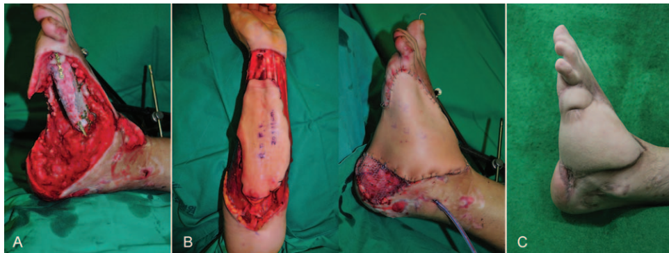
Figure 2. A, A complicated wound on left foot after a series of debridement. B, The wound was reconstructed with a free iliac bone and radial forearm free flap. C, At postoperative 1 year, the wound was healed well without any complications.