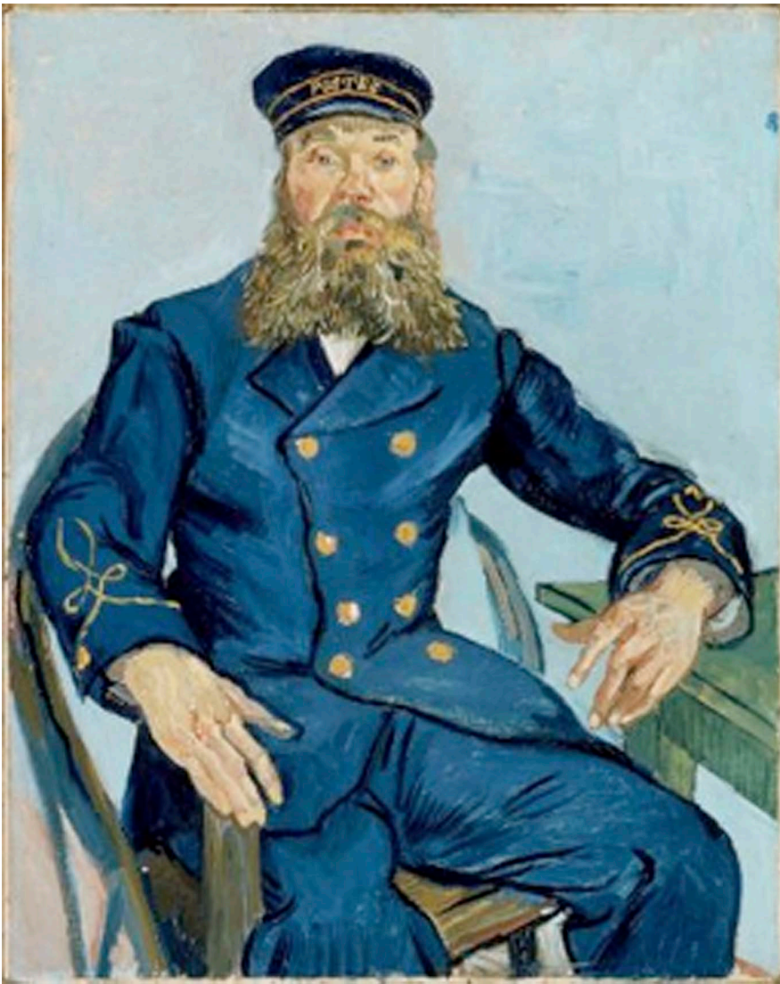
Figure 1. Arthritis as seen by Vincent van Gogh. This painting, "Portrait of the Postman, Joseph Roulin, sitting in a chair" (1888), is one of many portraits that van Gogh painted of individuals suffering from arthritis. The original painting belongs to the Museum of Fine Arts in Boston.

three groups. Conversely, the microbiota of the latter three cohorts was enriched in Bacteroides species.