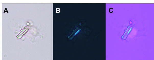
Figure 1 CPP crystal in SF.

Finding CC by radiographic means strengthens a CPPD diagnosis, but its absence does not rule it out. 2 It is not infrequent to have positive detection of CPP crystals in SF analysis in patients with a negative X-ray. 9-11 CPP crystal deposits in the fibrocartilage of the joints (most commonly in the menisci of