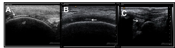
Figure 3 US findings of CPP crystals.

Notes: (A) US longitudinal scan demonstrates a hyperechoic band (white arrow) within hyaline cartilage of knee. (B) US transversal scan showing thin hyperechoic band within middle layer of hyaline cartilage of knee (white arrow). (C) US longitudinal scan of lateral dorsum of wrist that demonstrates hyperechoic band of carpal triangular ligament (white arrow).