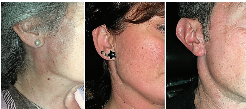
Fig. 3. Depression of the facial contour at 1 year. None (left), moderate (central) or major (right).