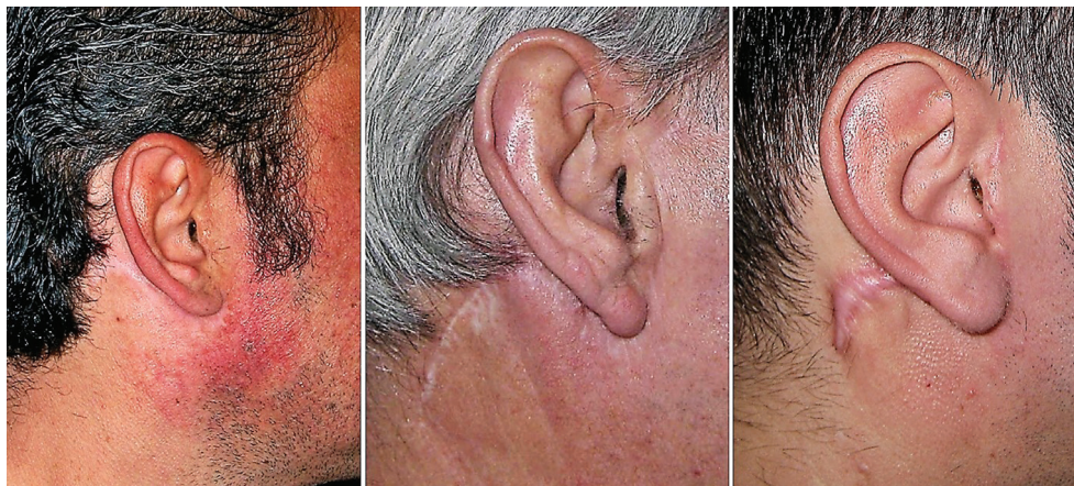
Fig. 2. Scar appearance at 1 year. Ideal (left), moderate (central) or hypertrophic (right).