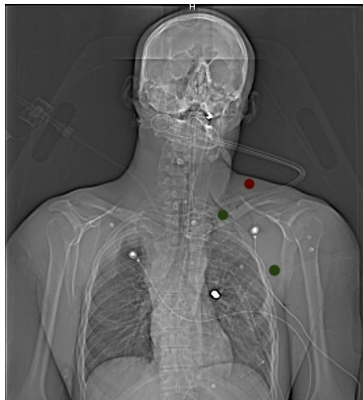
Figure 1 X-ray revealing a metallic fragment overlying the left hilum with depiction of the bullet wounds. There is one anterior wound in the left mid-supraclavicular region (red dot). Two left-sided posterior wounds are depicted with green dots with one in the superior mid-scapular region and another along the posterior midaxillary region at about the level of the third rib.

A patient in his 20s presented to our trauma bay after sustaining multiple gunshot wounds to the left thorax. Upon arrival, the patient was hypotensive with a blood pressure of 95/58 mm Hg, heart rate of 129 beats/minute, respiratory rate of 29 breaths/minute, and oxygen saturation of 94% on 10L non-rebreather. The patient was intubated for airway protection due to mentation and concern for his respiratory status. Focal assessment with sonography in trauma revealed a small anterior pericardial effusion. Initial chest X-ray showed a widened mediastinum and left hemopneumothorax with a bullet overlying the left hilum. Secondary survey and adjuncts created a puzzling picture. On the left side, the patient had three gunshot wounds in the mid-supraclavicular, superior mid-scapular, and posterior midaxillary regions (figure 1). Additional injuries included a left scapula fracture, left second and third rib fractures, and fractures of the anterior T1 and T2 vertebral bodies. On the right side, the patient had a palpable thrill at the right neck and supraclavicular region and was found to have a mid-shaft clavicle fracture and a large subclavian artery pseudoaneurysm with concern for active extravasation (figure 2). No injuries were identified