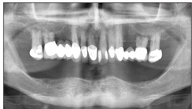
Figure 1. Presurgical panoramic radiograph of the patient.