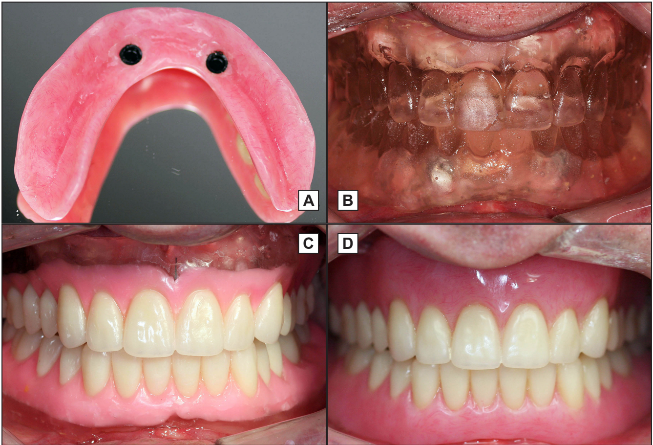
Figure 3. A = internal view of the implant-retained mandibular overdenture. B = intraoral view of the patient after both duplicate trial dentures were inserted. C = intraoral view of the patient with new denture teeth were arranged. D = intraoral view of the patient after both maxillary complete denture and implant-retained mandibular overdenture were delivered.

and new denture teeth (Ivoclar Vivadent, Amherst, NY, USA) were arranged on the duplicate dentures (Figure 3C).