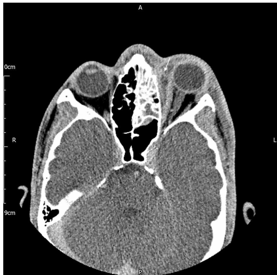
FIGURE 1: CT scan showing a subperiosteal abscess (white arrow) along the left medial orbital wall along with opacification of the left ethmoid sinus

The patient had no previous history of sinus related disease and was otherwise fit and well. During the follow-up period, the patient clinically improved with a reduction of eyelid swelling and there was no further obstruction of his sinuses. However, he developed a left-sided Horner's syndrome and was reviewed by ophthalmology. On examination, he had left-sided miosis and ptosis but no anhidrosis. Furthermore, reviewing a previous childhood photograph revealed no anisocoria.