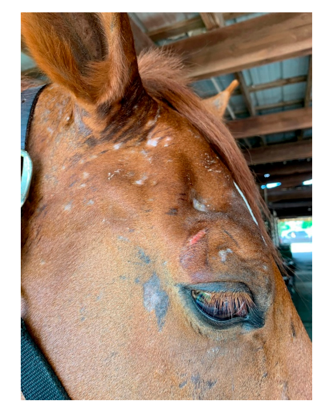
Figure 4. Horse diagnosed with environmental and insect allergies. The pruritus in this patient was intense and led to significant self-trauma.

depending on the study, and the bulk of the improvement is typically visible after the first year [123]. Some horses can be maintained with allergen-specific immunotherapy alone, while others still require other medications, although the amounts of medications necessary to make them comfortable may be decreased. Importantly, the success of immunotherapy was not reported to be different based on which allergy testing was used to select the allergens [135].