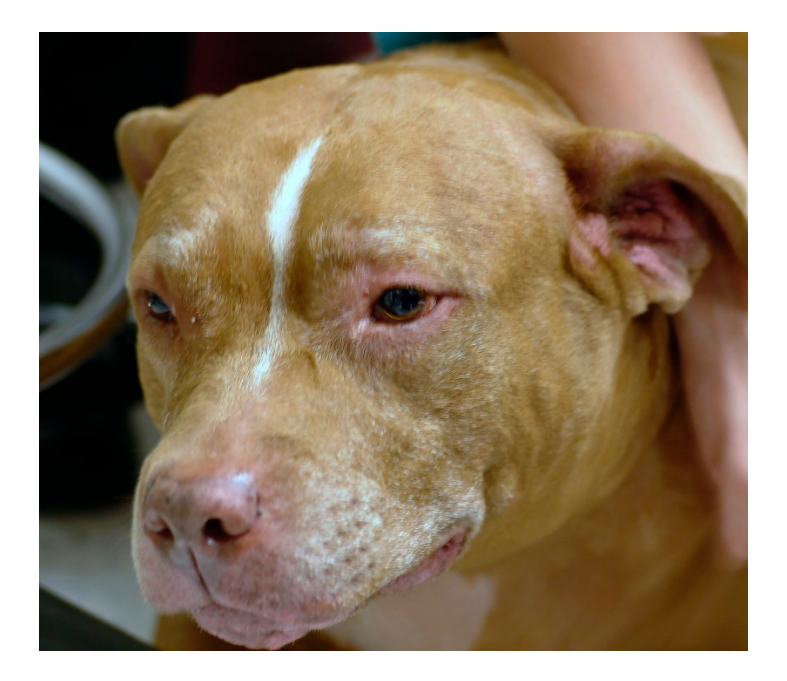
Figure 1. The muzzle, periocular area, and ears are predilected sites for atopic dermatitis in dogs, as shown in this patient.

Atopic dermatitis in dogs manifests as a pruritic inflammatory disease that affects body areas where the allergen is more readily absorbed epicutaneously. Examples of these areas are folds and areas with thinner skin and less hair. Examples include the antebrachial region, the axillae, and the inguinal area. The muzzle, periocular region, pinnae, and interdigital areas are other contact areas where exposure to the allergen is common. Thus, atopic dermatitis has characteristic predilected sites (Figure 1).