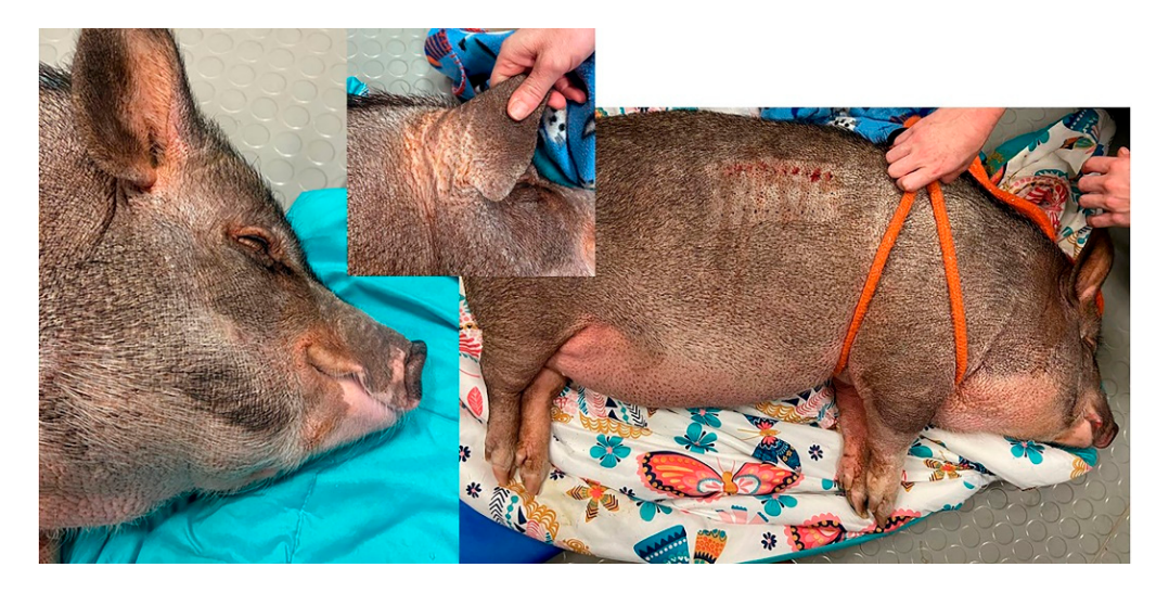
Figure 5. Pot belly pig presenting for pruritic dermatitis of face (periocular and perioral), ventral abdomen, and legs linked to environmental allergies and responsive to allergen specific immunotherapy.

Environmental allergy has been diagnosed in other species ranging from cows to pigs (Figure 5), and even in wildlife species. The author has skin tested and successfully performed immunotherapy in pigs (subcutaneous) and bats (oral) and is aware of oral immunotherapy done in bears. While mice have been used traditionally as a model for atopic dermatitis in people, this species does not spontaneously develop atopic dermatitis. Most rodent models involve some mutation which leads to the development of itch or inflammation, but the dermatitis typically does not mimic the complexity of disease seen in domestic animals.