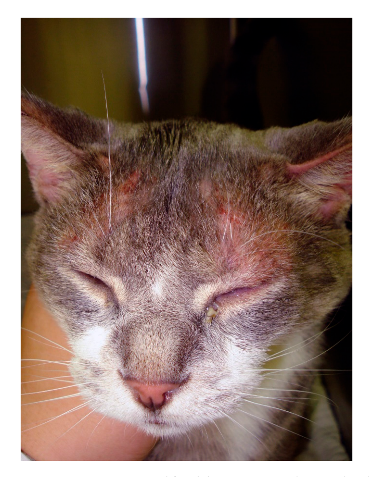
Figure 3. Severe pruritis and facial dermatitis in cat diagnosed with feline atopic skin syndrome. As facial pruritus can be triggered by many diseases, it is important to rule out mites, dermatophytes, and fleas before considering feline atopic skin syndrome as a clinical diagnosis.

The cutaneous manifestations of feline atopic skin syndrome are not the same as those in atopic dermatitis in people and dogs. Some cats can develop facial dermatitis (Figure 3) and pruritus, as in atopic people and dogs, but other feline manifestations of environmental allergies are peculiar to cats (e.g., indolent ulcer, eosinophilic plaque).