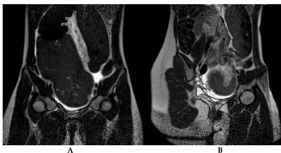
Figure 2. Sigmoid colon volvulus in a 14-year-old girl. Coronal T2 weighted MRI images demonstrate closed-loop obstruction of the sigmoid colon with severe visceral dilatation (A) and whirlpool sign (B); abdominal free fluid is also depicted.