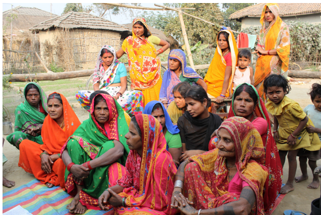
Figure 1 Women during a focus group discussion in a village in Saptari.

Awareness levels regarding uterine prolapse are rising. One example for this is the increasing awareness among women about the danger of after-birth practices, such as