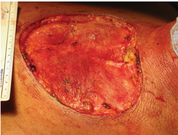
FIGURE 2: Surgical defect measuring 145 cm 2 .

the lung, which rapidly progressed causing his death, just three months later.