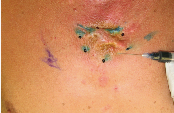
FIGURE 1: Keloid appearance at presentation. (methylene blue injection for sentinel lymph node biopsy).