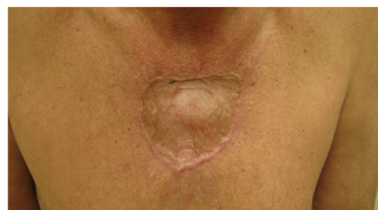
FIGURE 5: Partial-thickness skin graft after complete healing.