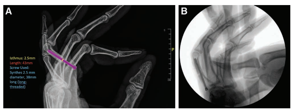
Fig. 1. A, Proximal phalanx fracture is measured on lateral radiograph. An isthmus of 2.5 mm (yellow) and length of 43 mm (red). B, A 38-mm Synthes screw of 2.5-mm diameter is chosen and superimposed with immediate intraoperative fluoroscopic imaging on lateral view.

the most important factor to guide the choice of the appropriately sized screw to ensure contact between screw and bone without causing blow out. General guidelines are outlined below with preference for wider diameter screw after canal reaming (Table 1). Screw length is recommended to be 4–6 mm shorter than full bone length (Fig. 1).