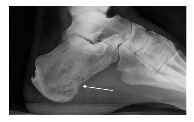
Fig. 1 Chondrosarcoma of the calcaneus in a 52-year-old male. Plain radiograph showing osteolysis and calcification with soft tissue extension of the tumour.

open biopsies. In cases of suspected Ewing's tumour, a needle biopsy can allow a very quick and safe diagnosis.