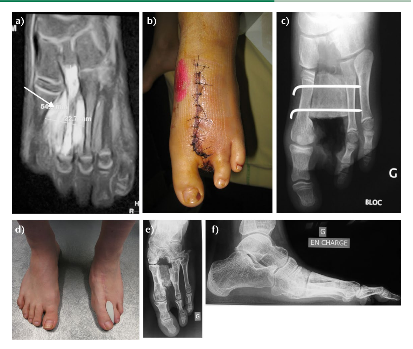
Fig. 4 This ten-year-old female had a Ewing's sarcoma of the second metatarsal. She received six VIDE courses of induction chemotherapy. a) MRI of the left foot before local treatment. b) Post-operative appearance of the foot after second and third metatarsal resection. c) Post-operative radiograph after iliac crest bone grafting to fill the gap between the remaining metatarsals. d) Appearance of the foot 11 years after surgery and post-operative radiotherapy. e, f) Radiographs of the foot at last follow-up.

lower dermis, but the epidermis is typically intact. On an MRI, they may be well-defined when small with a benignlooking appearance with a slightly increased intensity on T1-weighted images compared with muscle in about half the cases. CC sarcomata become less distinct as they enlarge along other soft tissue structures. On T1, they have low signal but are slightly brighter than muscle. On T2, they are bright and enhance with contrast. Prognosis is poor, local recurrence and metastases are common, sometimes ten years after diagnosis, and the mortality rate is 37% to 59%.<sup>15</sup>