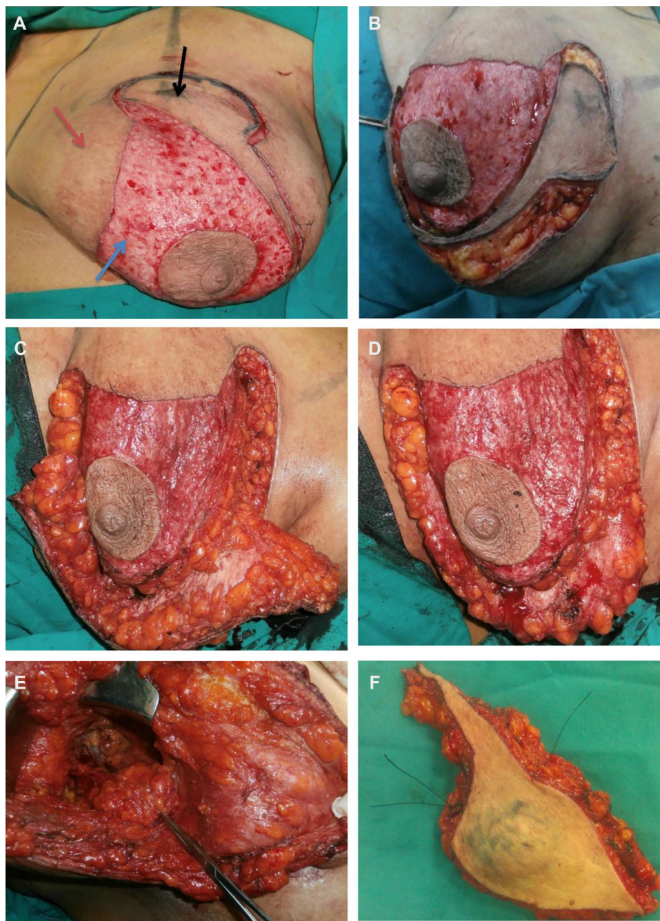
Figure 2 Tumor resection after deepithelialization.

Notes: (A) Deepithelialization of the distal half of the pedicle; black arrow points to the part to be resected; red arrow points to the intact part of the pedicle; blue arrow points to the deepithelialized part of the pedicle; (B and C) excision of the tumor-bearing area; (D) appearance after removal of the tumor-bearing area; (E) axillary dissection from the same wound; (F) specimen containing the tumor.