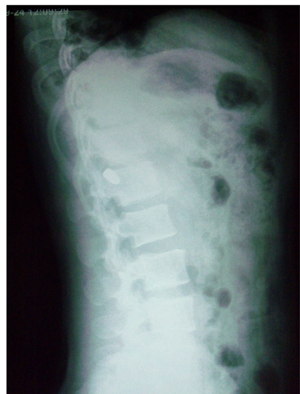
Figure 2 Lateral abdominal radiograph of the patient. Radiograph showing bullet to be lateral to the spine.