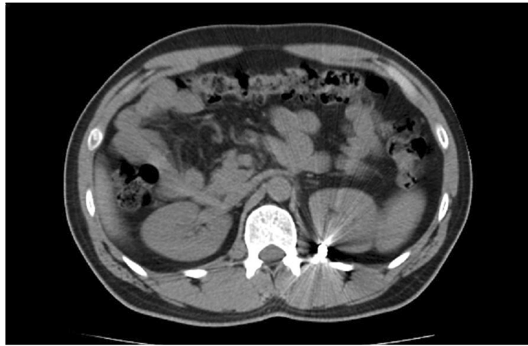
Figure 3 Transverse view of CT scan. This view shows the bullet to be lodged postero medially to the left kidney.

the spine. All thoracic, intra peritoneal and retroperitoneal visceral structures were identified to be normal with no injury.