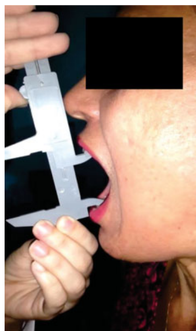
Fig. 4 Measurement of oral opening.