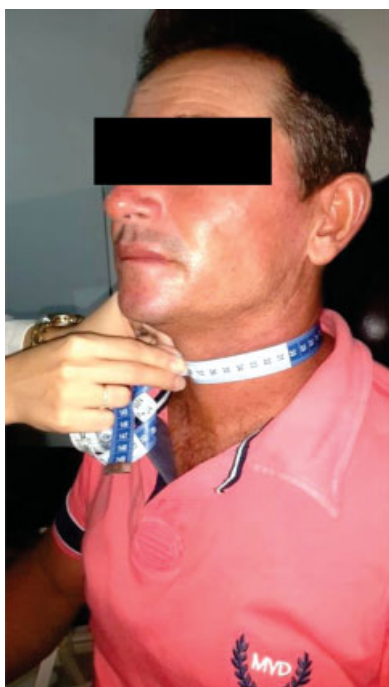
Fig. 3 Measurement of cervical circumference.

After evidencing the lack of possibility of visual access to the D'Avila's Areas, especially Area I, which corresponds to the anterior third of the vocal folds and the anterior commissure of the larynx, it was introduced the first and important