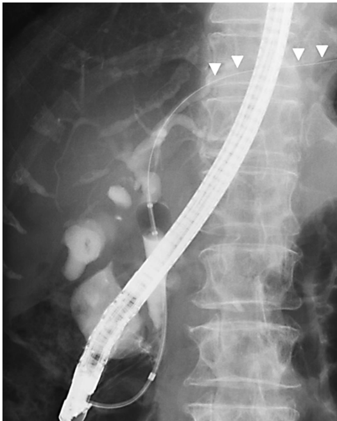
Fig. 2. ERCP imaging showed deep cannulation of the guide wire into the left intrahepatic bile duct (arrowheads).