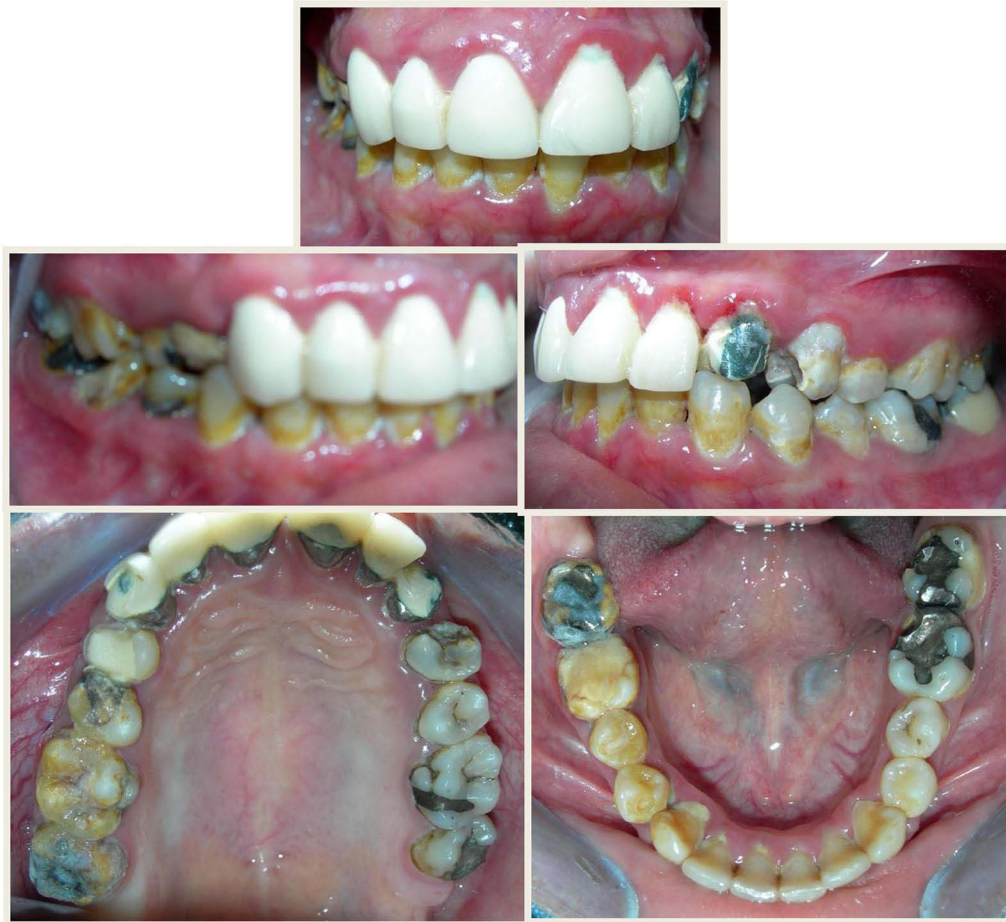
Figure 1 Preoperative images from different angles showing the ill-fitting crowns and multiple carious lesions.