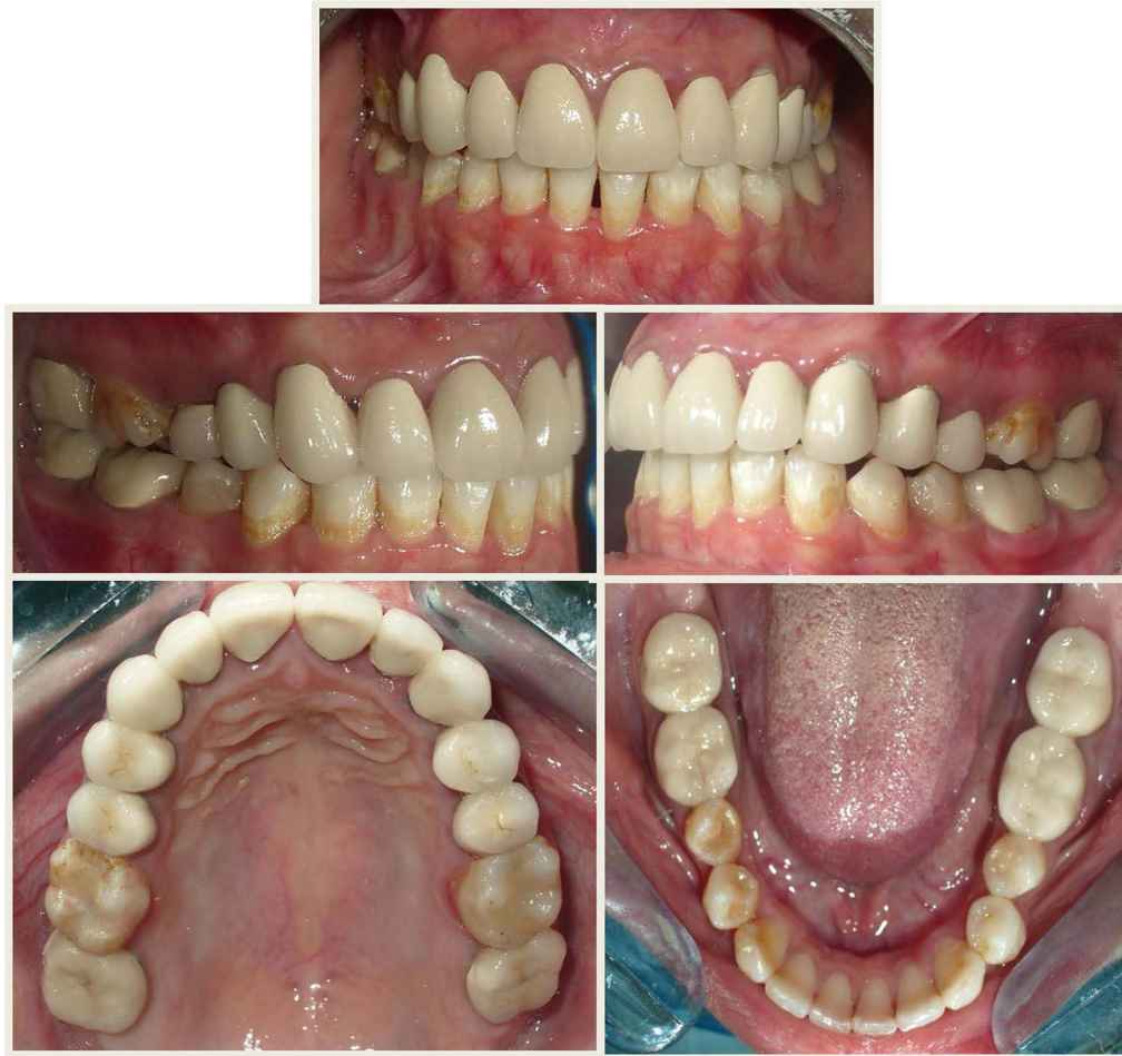
Figure 6 Post-operative images at one-year follow-up showing the functional and esthetic rehabilitation of high caries risk using evidence-based approach.