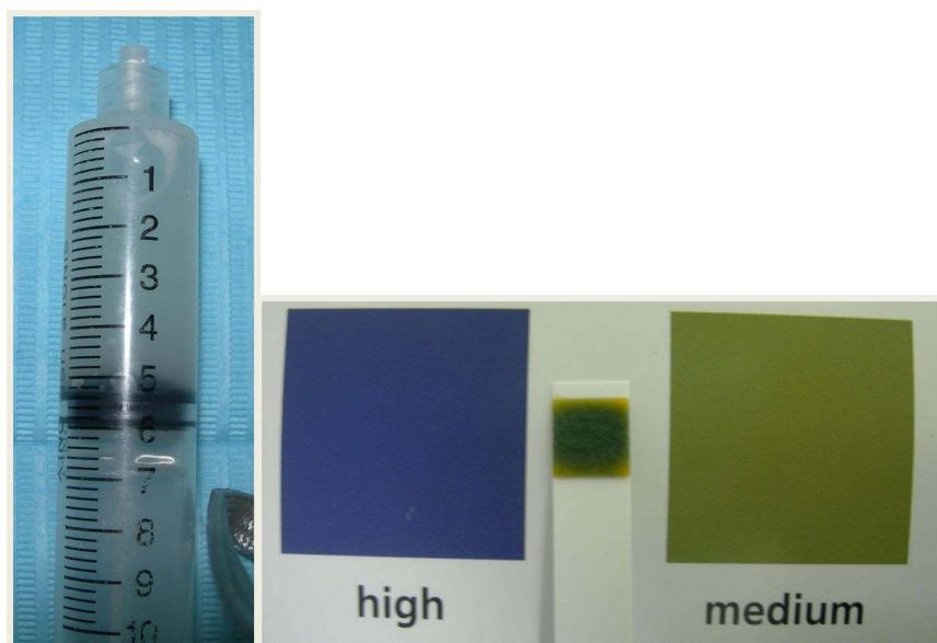
Figure 3 Caries risk assessment using salivary flow and salivary buffer capacity tests.