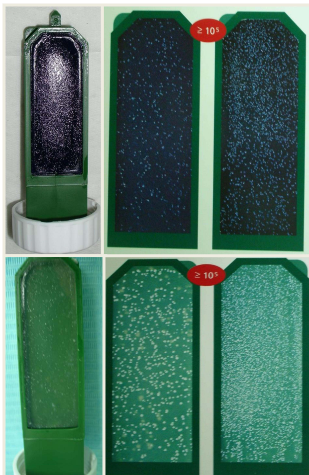
Figure 4 Caries risk assessment evaluating the salivary microbial load of Streptococcus mutans and Lactobacillus spp.