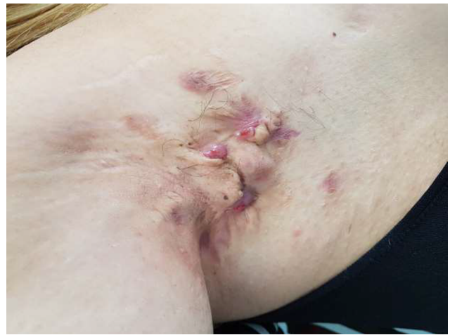
Figure 2 Hidradenitis suppurativa: clinical aspects.

In general, HS is localized in the apocrine gland-bearing areas of the body such as axillae, inguinal and anogenital regions, perineum, and inframammary area of female patients (although aberrant lesions may occur in the waist, abdomen, specially periumbilical region, and thorax). 1 The sites affected by HS correspond not only to the location of apocrine glands but also to the location of terminal hair follicles dependent on low androgen concentrations. 45 HS is initially characterized by the presence of tender subcutaneous nodules (commonly indicated as “boils” or “pimples”) (Figures 2 and 3). Up to 50% of patients report a burning or stinging sensation, pain, pruritus, warmth, and/or hyperhidrosis, 12–48 hours before