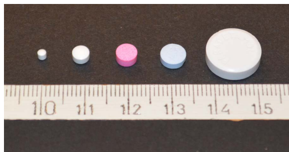
Figure 1 Tablets of different sizes. From left to right: 2 mm mini-tablet; 4 mm mini-tablet; 5 mm tablet (fludrocortisone acetate 0.0625 mg); 6 mm tablet (thyroxine 0.025 mg); 13 mm tablet (paracetamol 500 mg).

Safe and effective paediatric pharmacotherapy requires careful consideration of selecting the type of drug, a suitable dose and an age-appropriate formulation, and the younger the child, the more the attention that is required. The lack of knowledge on the pharmaceutical development and production of medicines for (the youngest) children has been identified as a barrier to essential medicines. Recent global incentives and funding opportunities have resulted in increased research in this domain and in an integrated approach to formulation development. Key aspects involve the development of (novel) dosage forms such as mini-tablets and orodispersible formulations, the safety of excipients, child acceptability and the importance of suitable dosing devices. The acquired knowledge is useful to formulation scientists as well as to doctors, pharmacists and caregivers when prescribing, compounding, dispensing or administering medicines to children.