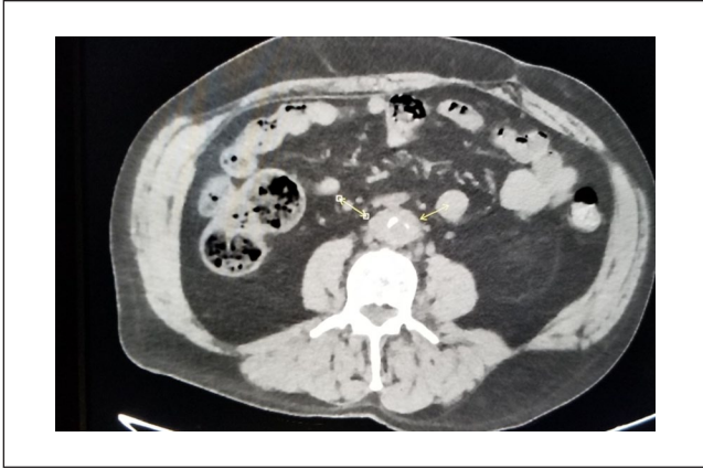
Figure 3. Retroperitoneal fibrosis.

months to years. 4,7 It is quite possible that mass lesions from IgG4-RD can be misdiagnosed as malignancy. 4 Multiple organ systems may be involved, and patients may develop vision loss, hearing deficits, pleural effusion, constrictive pericarditis, and chronic kidney disease. Constitutional symptoms such as weight loss and fatigue have been described and were noted in our patient. Kidney involvement in IgG4-RD may manifest in several different ways, including ureteral obstruction from retroperitoneal fibrosis to the tubulointerstitial disease with plasma cell infiltration seen in this patient. 6,8-11 Patients with retroperitoneal fibrosis may complain of vague pain. 11,12 The patient in the case did complain of vague lower abdominal pain for several months prior to current presentation and reported gradual worsening of his lower abdominal pain that led to a diagnosis of retroperitoneal fibrosis on CT imaging, but there were no signs of hydronephrosis or obstructive uropathy. Another way that the kidneys can become injured in IgG4-RD is from tubulointerstitial infiltration with IgG4-secreting plasma cells.