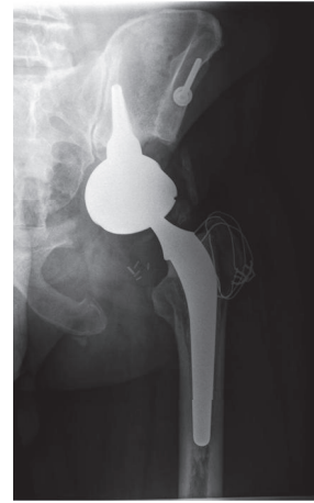
FIGURE 3: Radiographs: 12 months after surgery.

We report the case of a 55-year-old male patient presenting hydatidosis of the left ischiopubic branch with a joint invasion. The disease, caused by Echinococcus granulosus , most frequently affects the liver (40%) and lungs (20%). Bone affection occurs in only 0.5% to 2% of cases, preferentially the spine (44%), the long bones (30%), the pelvis (16%),