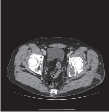
FIGURE 1: CT-scan: osteolytic lesion on the ischium.