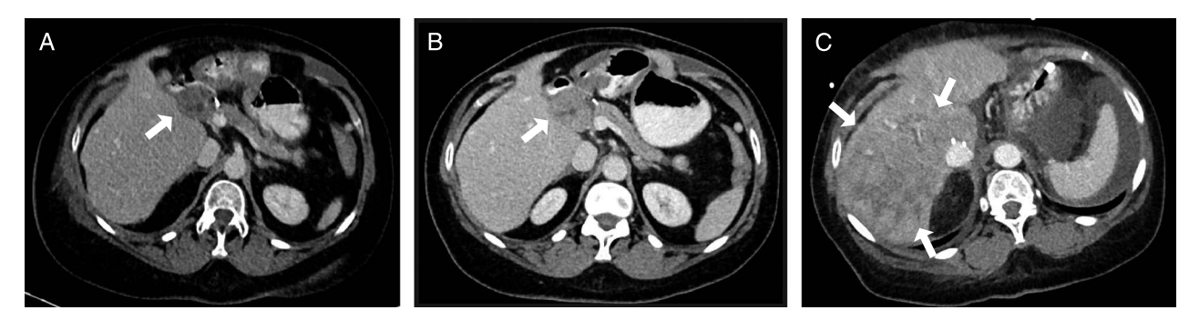
FIGURE 3. Abdominal imaging. A, Contrast-enhanced CT scan demonstrating an enlarged lymph node in the liver hilum (arrow) due to HCC recurrence 27 months after liver transplantation. B, CT scan 9 months later with stable lymph node before nivolumab treatment 35 months after liver transplantation. C, CT scan at the day of death 25 days after nivolumab treatment with inhomogeneous hypodense areas in the right hepatic lobe (arrows) suggestive for parenchymal necrosis. No signs of intrahepatic HCC recurrence. CT, computed tomography.