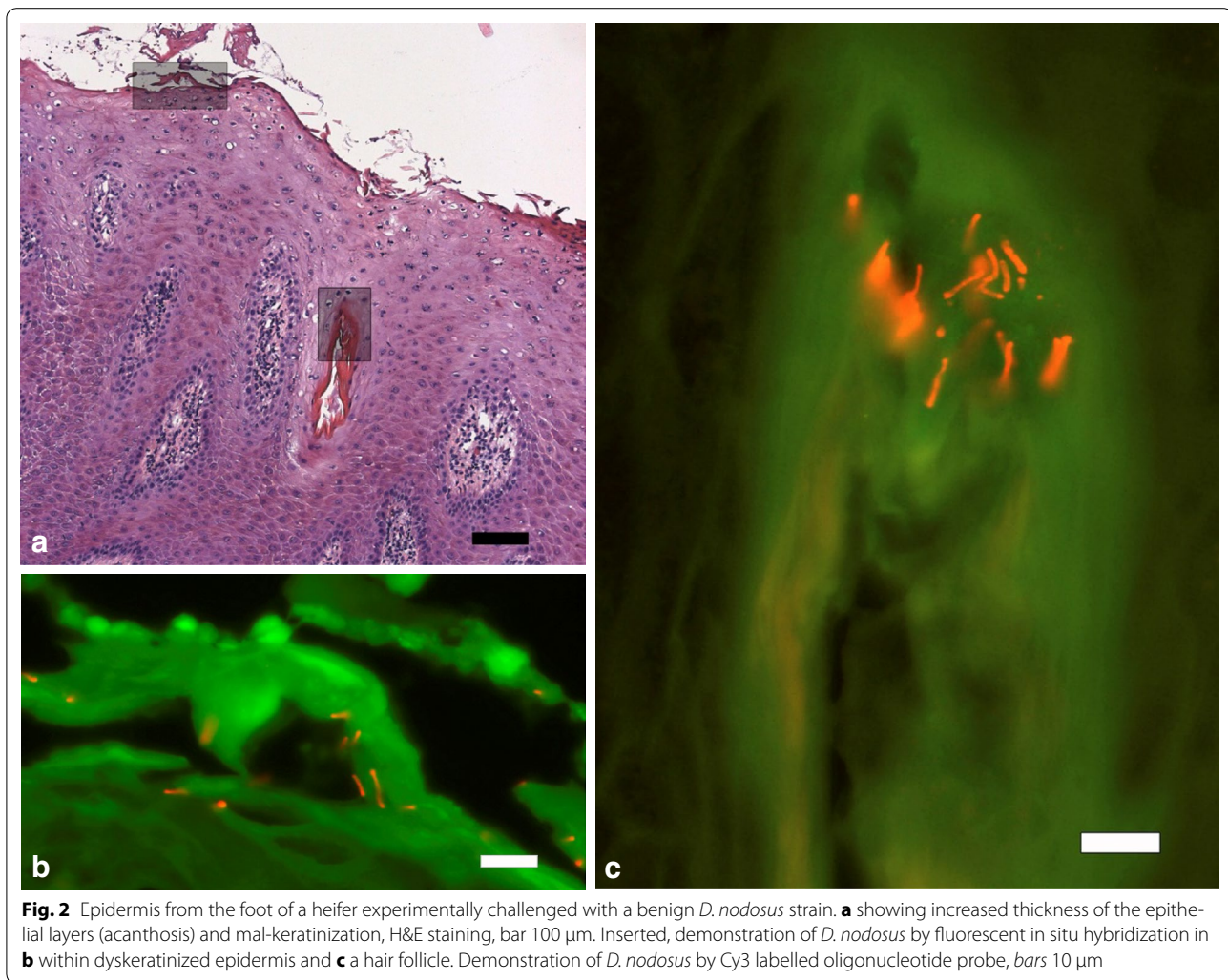
Fig. 2 Epidermis from the foot of a heifer experimentally challenged with a benign D. nodosus strain. a showing increased thickness of the epithelial layers (acanthosis) and mal-keratinization, H&E staining, bar 100 µm. Inserted, demonstration of D. nodosus by fluorescent in situ hybridization in b within dyskeratinized epidermis and c a hair follicle. Demonstration of D. nodosus by Cy3 labelled oligonucleotide probe, bars 10 µm

In conclusion, this study shows that both benign and virulent D. nodosus originating from sheep can colonize the interdigital skin of naïve heifers under experimental conditions. Further, the study supports the hypothesis that infections with virulent D. nodosus in cattle are associated with interdigital dermatitis. No conclusion regarding the treatment of D. nodosus infection with chlortetracycline was possible. The ability of D. nodosus to cross between sheep and cattle is epidemiologically important, and cattle should be considered a possible source of virulent D. nodosus to sheep when planning and implementing elimination programs.