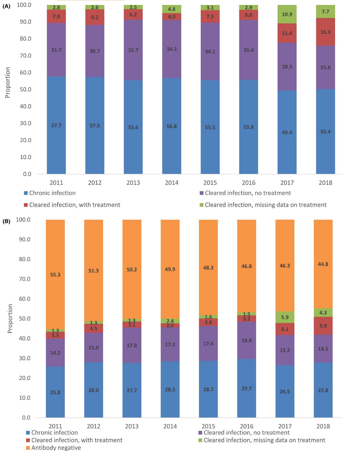
FIGURE 1 Prevalence of chronic and cleared HCV infection among PWID in England, 2011–2018. Figures present (A) HCV antibody positives only and (B) all respondents. HCV, hepatitis C infection; PWID, People who inject drugs. Antibody-positive samples that were missing RNA had data imputed with MICE