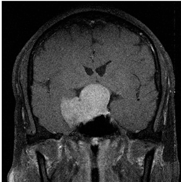
Figure 2. Patient 16 had a tumor that measured 33.51 cm 3 . It had invaded the paracavernous area; therefore, only partial removal could be achieved.