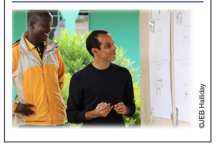
Photo 1. Development of bespoke cartoons in consultation with Tanzanian end-users to create culturally appropriate communication tools for One Health research.

genuinely understood the research goals, nor had they had time to reflect on whether or not to take part in the study. This is not a new problem in development research. The standard consent process of a single meeting between investigator and volunteer may be insufficient for adequate comprehension of informed consent.<sup>22</sup> Indeed, Sreenivasan argues that full comprehension is rarely achieved in research and should be considered an ethical aspiration rather than a minimum standard,<sup>23</sup> claiming that if full comprehension was a necessary condition of valid consent then much scientific endeavour would be impossible. To protect prospective research participants, their level of understanding can be assessed prior to consenting. Cooper and colleagues used comprehension and engagement scores to test the effectiveness of 3 communication tools-written documents, illustrative photographs, and illustrative cartoons—when providing study information to 22 Tanzanian livestock keepers prior to consent.<sup>21</sup> Cartoons were associated with significantly higher engagement scores, highlighting the usefulness of alternative means of information provision.