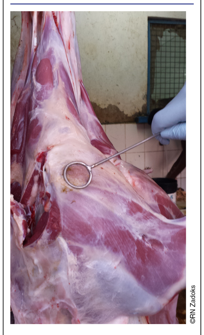
Photo 3. Staff training in standardized methodology for carcass swabbing to support slaughterhouse-based surveillance of meat borne pathogens such as non-typhoidal Salmonella and Campylobacter species. Moshi, Tanzania.

actual bacteria, which is difficult to obtain due to low levels of bacteremia in patients, transient bacterial shedding by infected animals, and constraints on culture of the organism. Using serological data from field studies and sophisticated modelling approaches, goats were implicated as the most likely source of human infection in northern Tanzania.<sup>54</sup> This study also used simulated data to show that even small amounts of data on bacterial species identity—or comparable subtyping—are sufficient to inform models aimed at quantifying transmission between host species, thus justifying