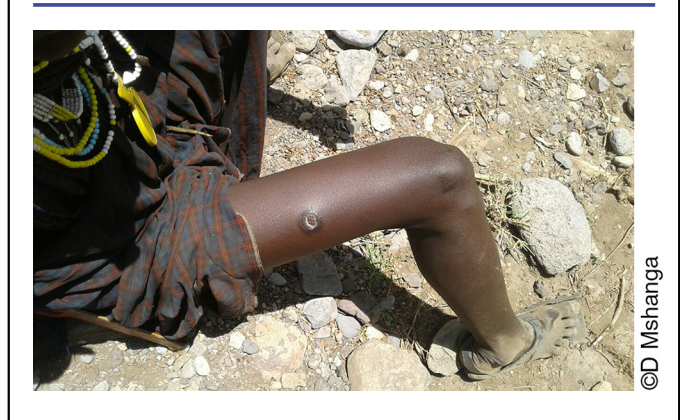
Photo 4. Cutaneous anthrax in a resident of the Ngorongoro Conservation Area where anthrax is an endemic disease with seasonal peaks in wildlife, live-stock, and human case numbers.