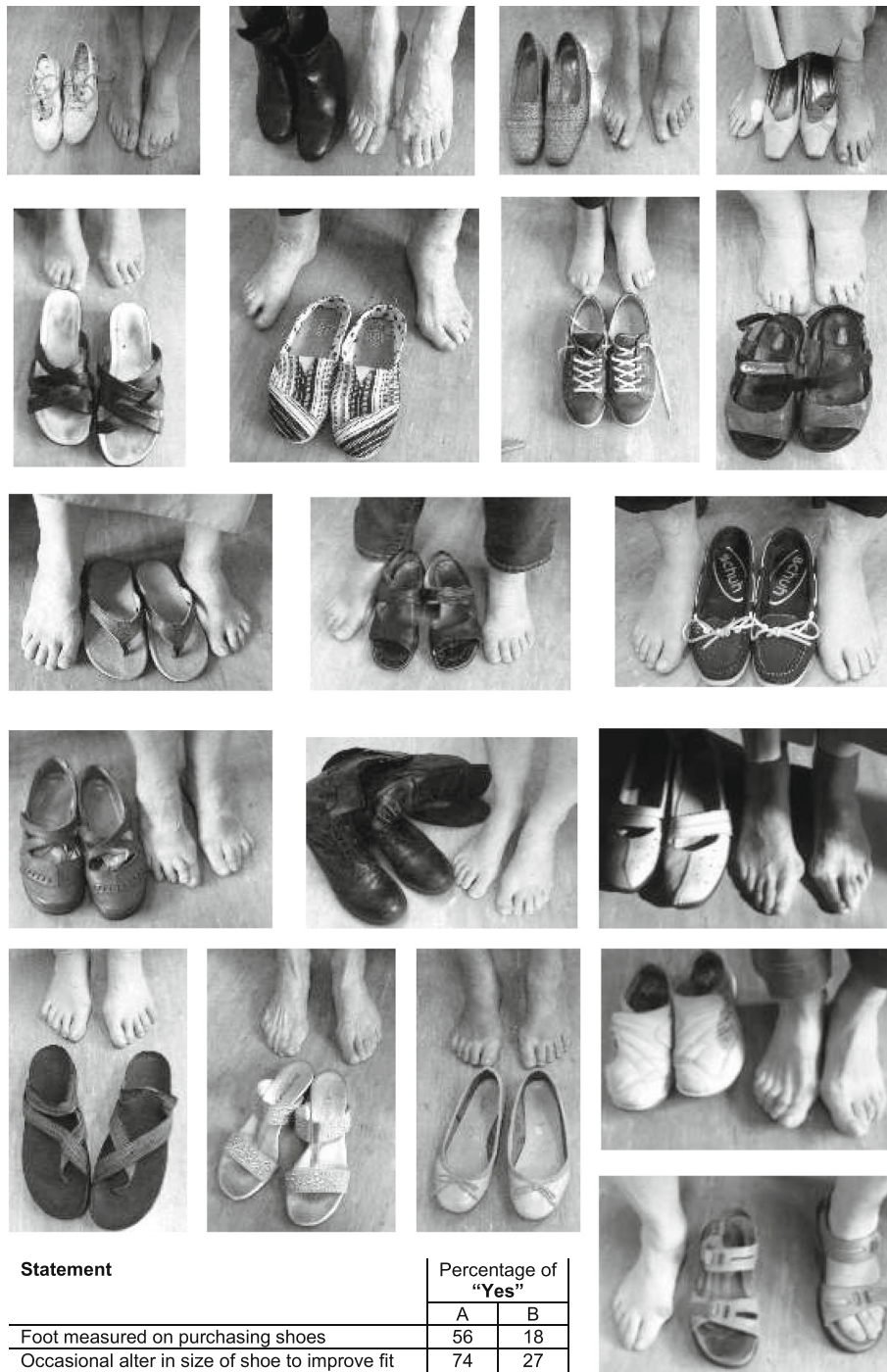
Fig. 1 Types of footwear worn to clinic by a selection of participants with data on preferences of foot measurement, altering shoe size to improve fit and frequency of footwear worn