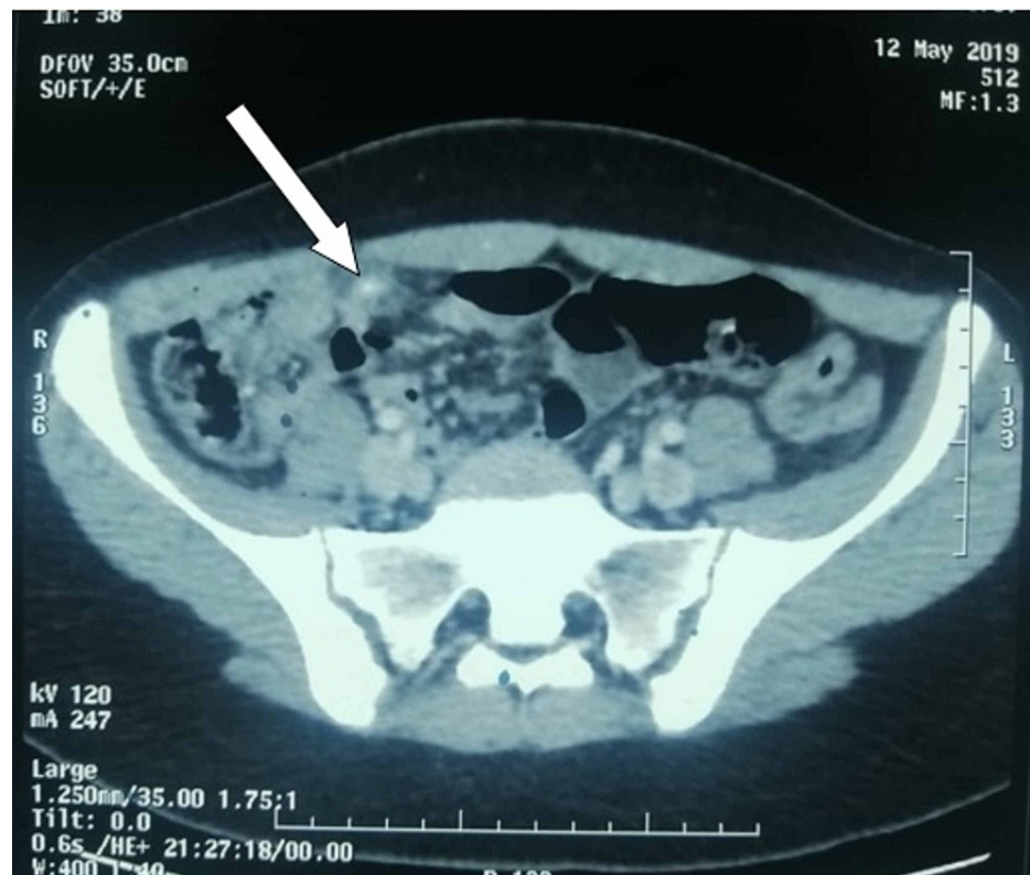
FIGURE 1: Axial contrast-enhanced CT showing of the abdomen showing dilated appendix associated with appendiceal wall thickening in favor of acute appendicitis and the presence of a linear spontaneously hyperdense image of 3 cm in length (white arrow)

The patient underwent open surgery that showed an inflamed appendix and the presence of an omental granuloma with the fish bone inside it. An appendectomy was performed and the omental granuloma was removed alongside the fish bone (Figure 2).