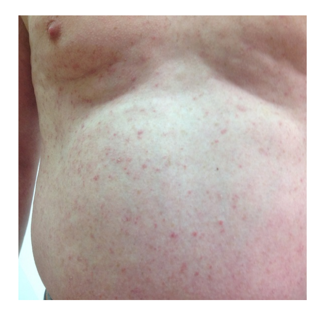
Fig. 1. Characteristic skin lesions in adult with classic scabies

and no major adverse events were observed in any of the 3 groups. The main adverse event was skin dryness, reported by patients treated with sulphur ointment longer that two weeks, but it was not serious and did not affect compliance. None of the patients experienced worsening of infestation during the study, but at two patients treated with sulfur ointment re-infestation occurred at one-month follow-up.