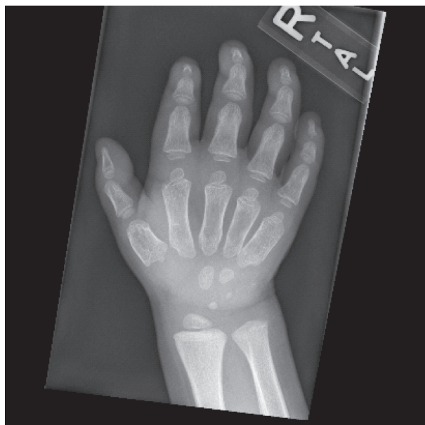
Figure 2 X-ray of the hand demonstrating the typical radiographic findings in patients with Hunter syndrome. The small density over the proximal hypothenar eminence in this image represents a foreign body.

Progressive neurologic deterioration characterizes the severe phenotypes of MPS II with slow global acquisition of developmental milestones during the preschool years. Behavior problems, particularly aggressiveness and hyperactivity, may be significant and quite taxing on care givers