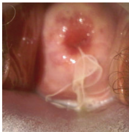
Figure 3. A Slide showing the edematous and reddened cervix.

This case was a young woman in the reproductive age group who desired to have more children. This incidental finding and treatment of this index case has probably contributed to preventing the complications of genital HSV infection viz a viz the possibility of sexual transmission of the disease, as well as perinatal transmission with emergence of congenital malformation in infants of infected mothers. This case also illustrates the importance of effective routine Pap smear for sexually active women.