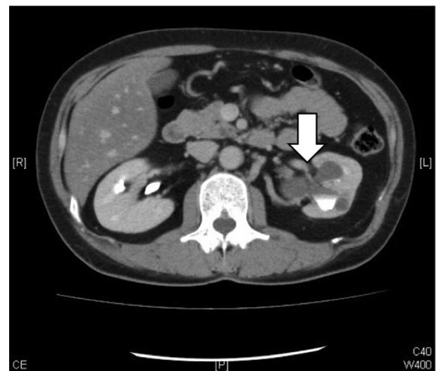
Fig. 2. CT scan axial view improves hydronephrosis (white arrow) in left kidney.

Deep infiltrating endometriosis is defined as lesions penetrating surrounding tissue by 5 mm or more 5 and is likely of multifactorial origin. It can affect both genital and extragenital organs. Of these, the most frequently involved are the large intestine and urinary tract. Patients usually present with multiple symptoms including abdominal pain, dysmenorrhea, chronic pelvic pain, dyspareunia,