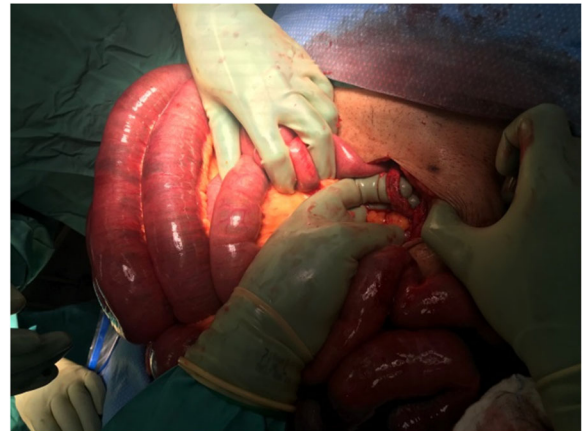
Fig. 2 Intraoperative photo revealing intraperitoneal LVAD driveline with small bowel looping behind it