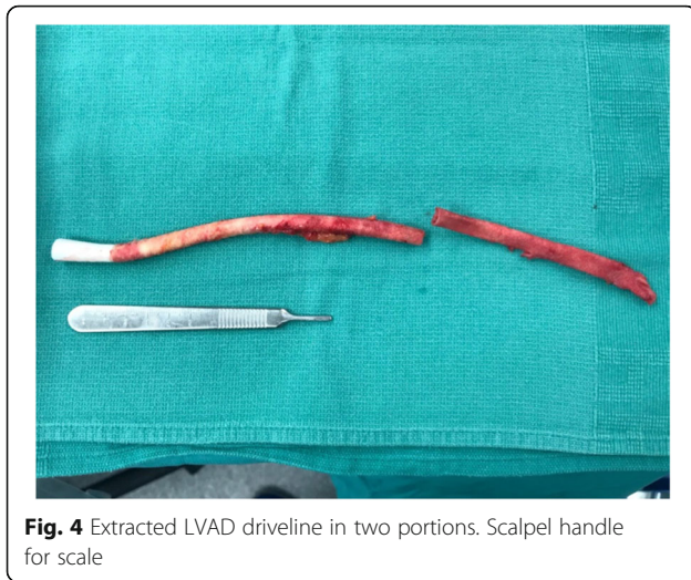
Fig. 4 Extracted LVAD driveline in two portions. Scalpel handle for scale

[4]. Commonly known complications of LVAD therapy include risk of bleeding, infection, pump thrombosis, device malfunction and stroke [3]. Less often reported are the non-cardiac surgical complications for LVADs. These may include respiratory failure, abdominal infections and wall defects, intestinal ischemia, obstructive complications, perforated viscus, gastrointestinal bleeding, diaphragmatic defects, cholecystitis, and pancreatitis [1, 2, 5]. Improvements to technology between first and second generation LVADs, as well as modifications towards device placement and driveline tunneling has reduced the incidence of infection, which is by far the most common complication of such [6–8]. Current protocol for LVAD placement includes creating a pocket in the pre-peritoneal space, with the driveline being tunneled under the subcutaneous tissue, above the fascia, and subsequently back out through the skin in the right upper quadrant. Proper tunneling technique is crucial in limiting driveline infections and ensuring proper placement of the device.