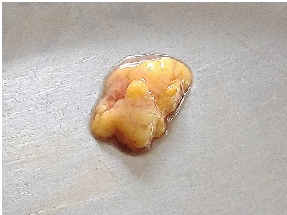
FIGURE 2: Excised specimen

The histopathological photomicrograph (30x) revealed adipocytes (fat cells) with clear cytoplasm (Figure 3). The patient did not turn for further clinical and radiological evaluation follow-up.