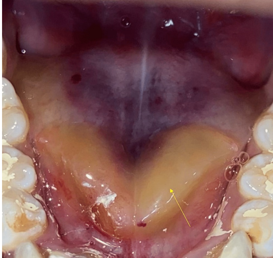
FIGURE 1: Intraoral examination revealed a yellowish colored swelling on the floor of the mouth resembling the shape of letter "V"

A 21-year-old female presented to our department for a routine dental checkup. Her medical history was non-contributory. Her personal history revealed that she had no harmful oral habits such as smoking or chewing tobacco. A general examination revealed that her vitals were stable. Extraoral examination did not reveal any cervical lymphadenopathy. Intraoral examination revealed an intraoral swelling on the floor of the mouth. On inspection, the swelling was yellowish in color and extending in the shape of the alphabet "V" on the floor of the mouth (Figure 1).