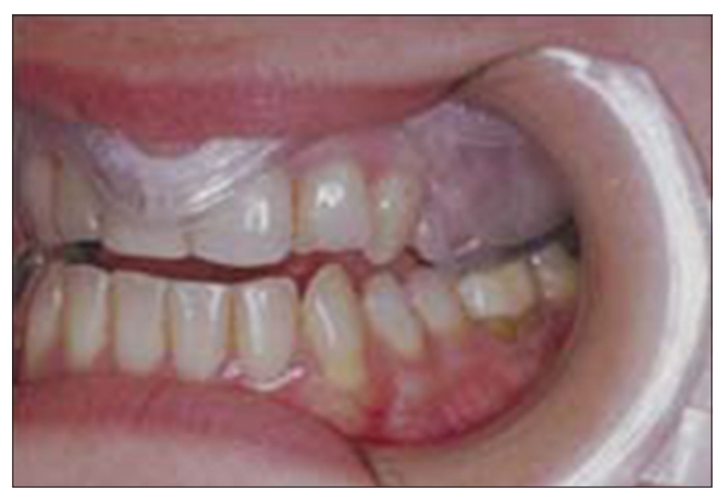
Figure 2: Oral splint with fluid (water-filling) in occlusion

Instruct patient not to take medication for facial jaw pain the day of the appointment. Rule out organic pathology and confirm adequate posterior occlusal support. Remove Aqualizer<sup>TM</sup> from package and insert in to the mouth. No preparation of the bite splint is necessary. Instruct the patient to keep the fluid pads between the posterior teeth [Figure 4]. The patient should relax and rest their teeth against the fluid pads while swallowing. It is not desirable