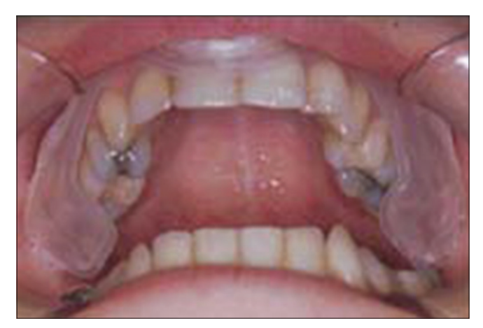
Figure 1: Self-adjusting oral splint in occlusion

Aqualizers are available in three different vertical dimensions: Low, medium, and high [Figure 3]. The amount of fluid in the Aqualizer<sup>™</sup> controls the vertical dimension (thickness). Medium volume aqualizers are used in most of the cases. Low volume aqualizers