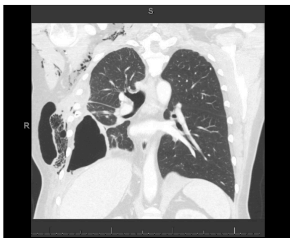
Fig. 3. Post-operative CT chest illustrating large right empyema with pleurocutaneous fistula resulting in large second collection in right chest wall and extensive subcutaneous emphysema.

tory response leads to increased risk of disseminated Salmonellosis [6,9]. The identification of this patient's DMARD therapy including tumor necrosis factor, adalimumab, as a key contributing factor for his pleuropulmonary salmonellosis was crucial.