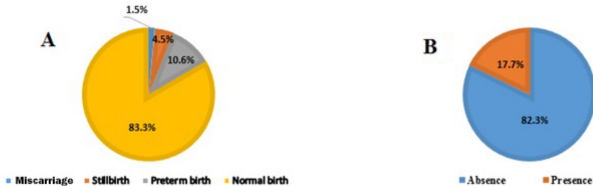
Figure 2. Frequency percentage of (A) pregnancy outcomes, and (B) prenatal-neonatal complications, in envenomed pregnant women.

A future study should investigate the relationship between adverse pregnancy outcomes and scorpion species, given that unknown scorpions (Table 4) were not included in the statistical analysis, and the relationship was assessed between known species and adverse pregnancy outcomes.