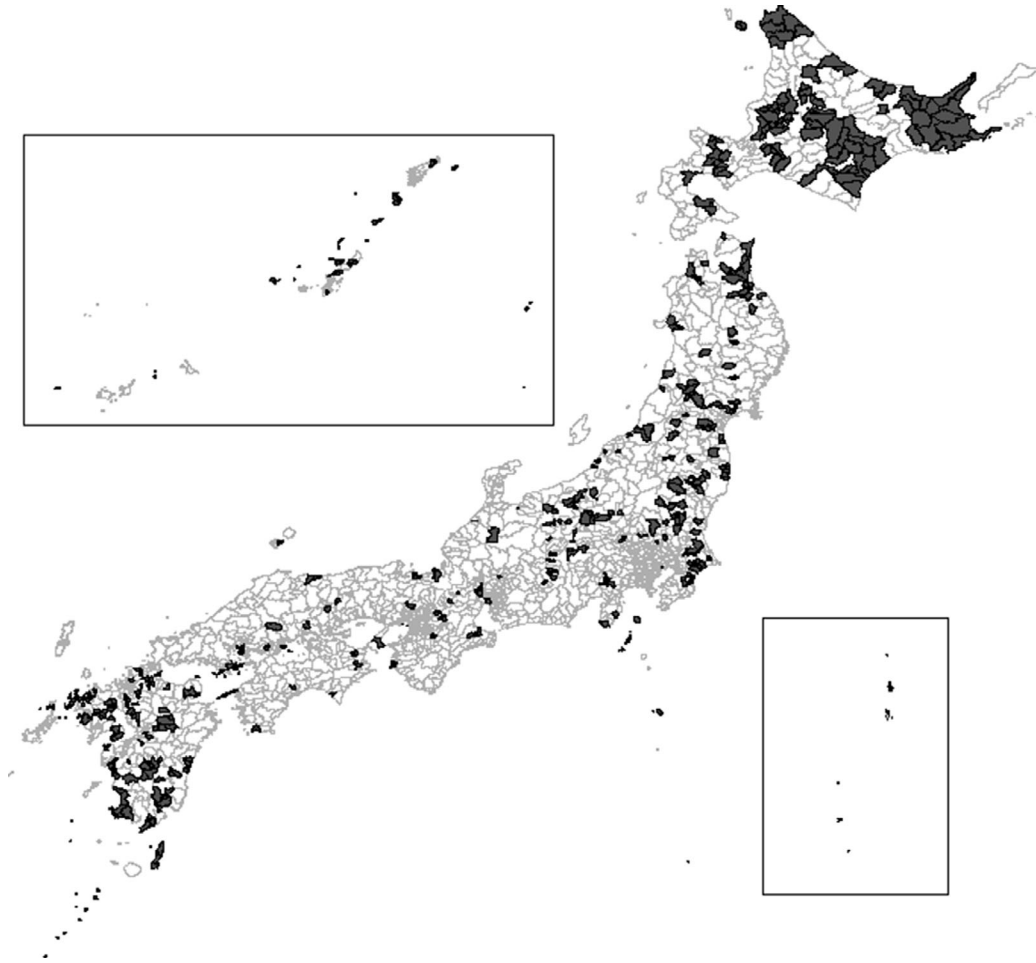
Figure 1. Agriculture-dominated municipalities throughout Japan selected for regression analysis.

2002 compared to other periods between 1983 and 2003. Male suicide SMR has been rapidly increasing, with a particular growth seen in the period from 2003 to 2007 in municipalities with a “high” (i.e., the second highest) level of animal husbandry output. No such correlations could be observed in the data relating to agricultural crop per unit population.