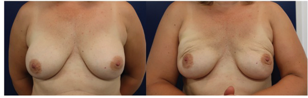
Fig. 3 Patient with severe BAD following subpectoral direct-to-implant breast reconstruction. BAD, breast animation deformity.

difficult to differ skin contraction from entire movement in some cases.