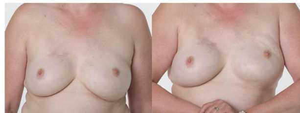
Fig. 4 Patient with mild BAD following prepectoral direct-to-implant breast reconstruction. BAD, breast animation deformity.

Follow-up was comparable between groups. Besides our small population another limitation of this RCT might be the follow-up time. Patients were seen 12 months after surgery, but we do not know if BAD changes over time. It might be worsened in the subpectoral reconstructed group 5 years after surgery. We must also keep in mind that even though the incidence and degree of BAD seems minimized using the prepectoral plane, disadvantages, such as rippling, bottoming out, visible implant edges, and possible ptosis over time,