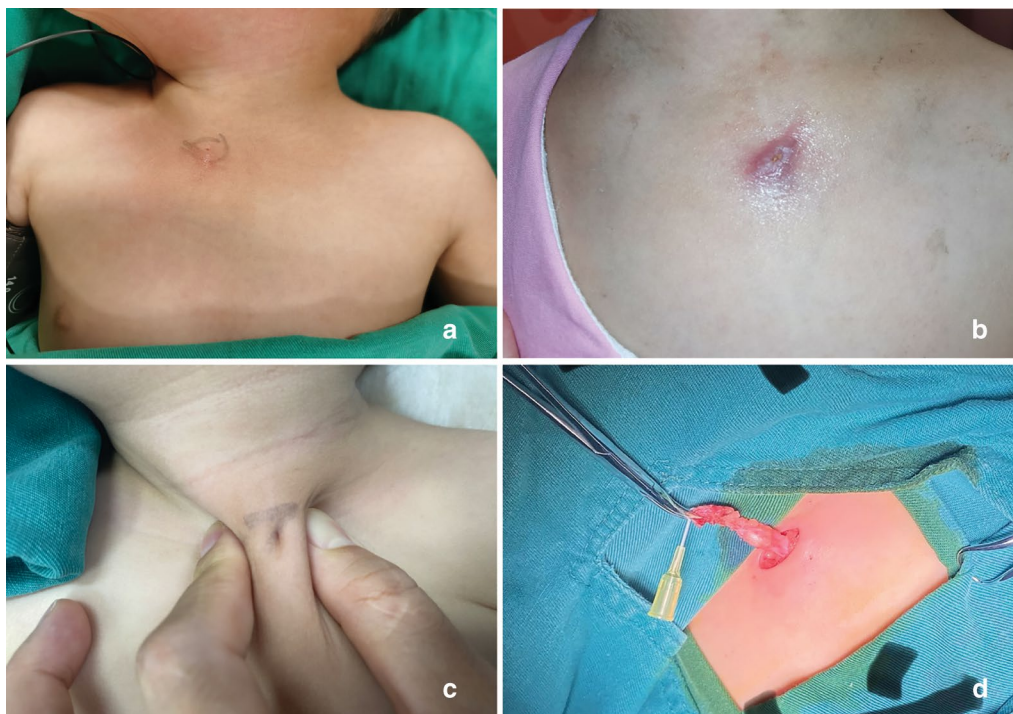
Fig. 1 a Right congenital sternoclavicular sinus in a 20 months old girl; b Left sternoclavicular sinus in a 5 years old girl with recurrent infection; c Left sternoclavicular sinus in a 2 years old boy; d Dissection of the sinus with a catheter indwelling

All patients presented with a pit of the skin over the sternoclavicular joint along the line of the anterior margin of sternomastoid muscle since birth. In thirty-nine patients (44.3%), the parents described that there was a small amount of yellow or white solid drainage in the pit when squeezing. The drainage was mucous-like in two patients. Sixty-three patients (71.6%) experienced the history of sinus infection. The mean age of infection was 2.16 \pm 1.55 years old. Of the patients with sinus infection, 44 patients (69.8%) underwent I&D for the abscess formation.