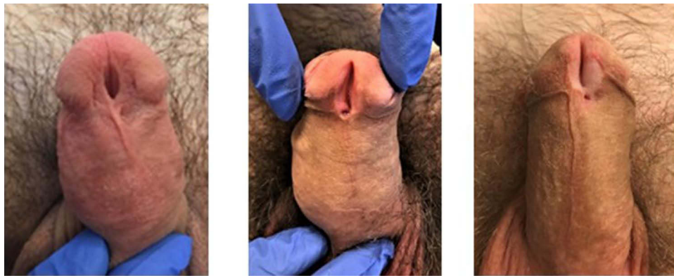
Figure 2 Three representative men with uncorrected hypospadias included in this report. Note that none have glans fusion.